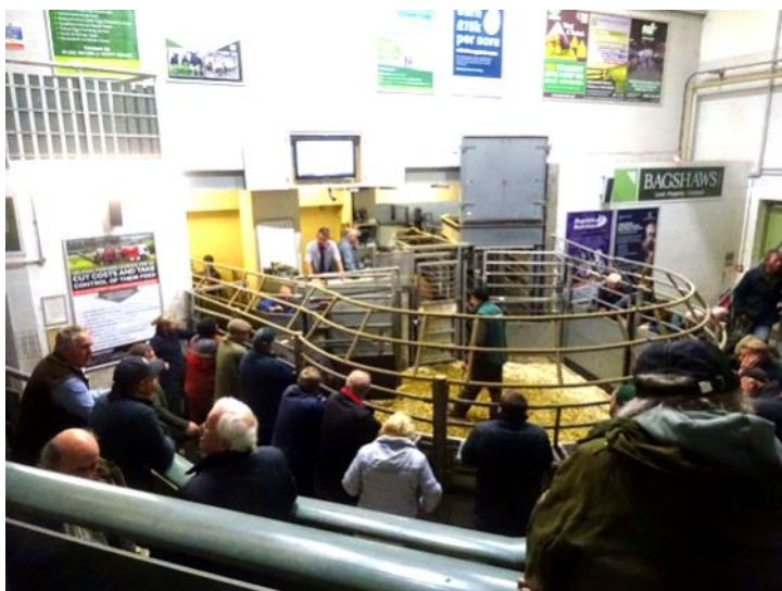
Cattle Auction at Bakewell