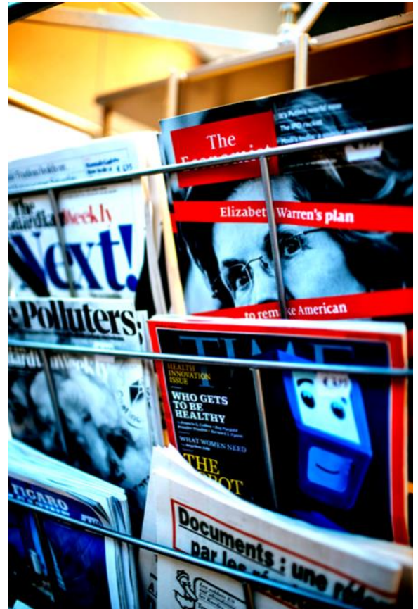
Keeping up with Current Affairs