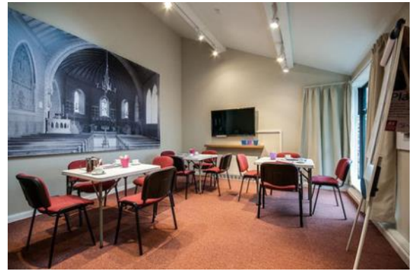
The very comfortable Inghams Room at Spring Bank Arts