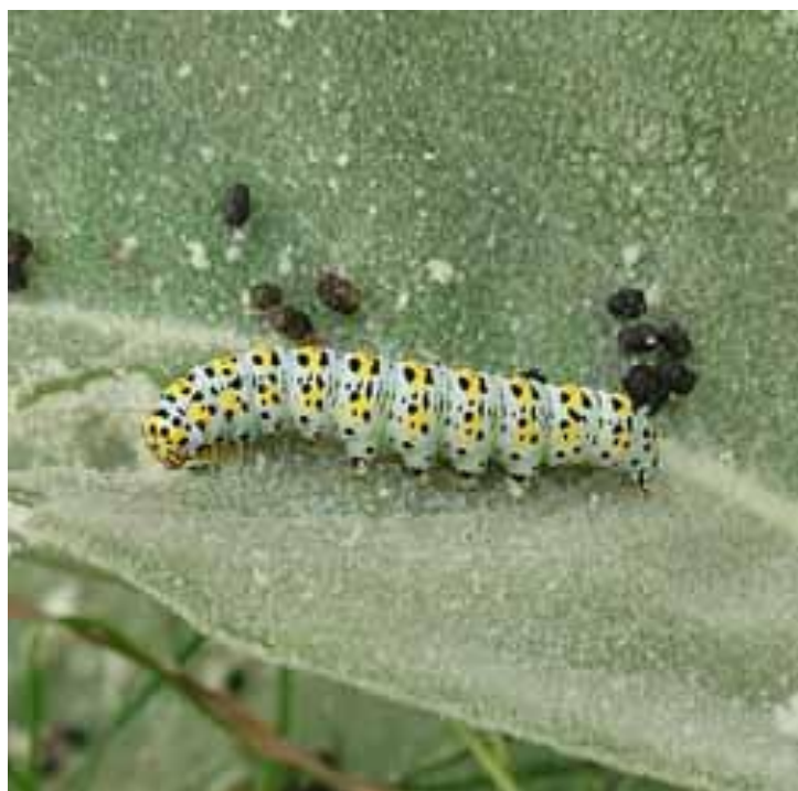
Mullein Moth Caterpillar