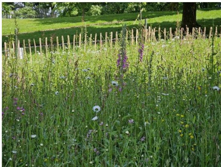
One of the Areas the Field Club Volunteers Manages