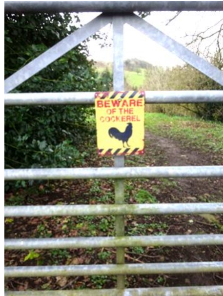
The Dangerous Cockerell of Hathersage