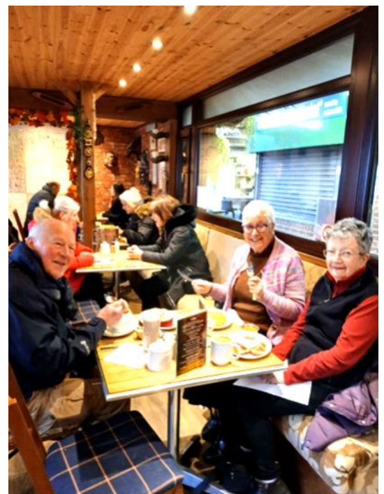
Enjoying lunch in Bury