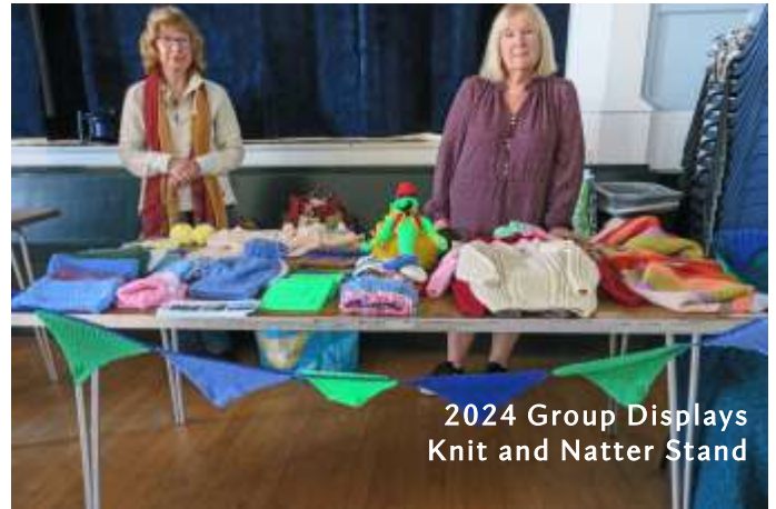
2024 Group Displays Knit and Natter Stand

Contact: groupscoordinator@newmillsu3a.org.uk