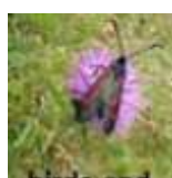
birds and botany