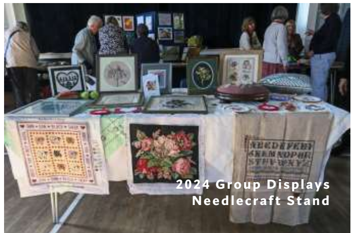
2024 Group Displays Needlecraft Stand

Contact: groupscoordinator@newmillsu3a.org.uk