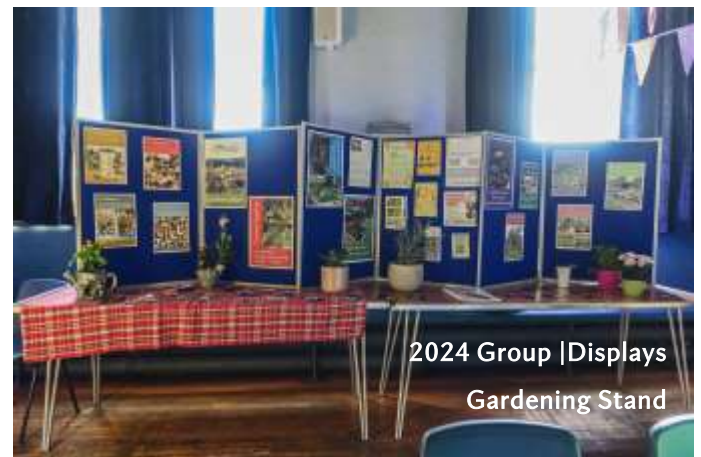
2024 Group | Displays Gardening Stand