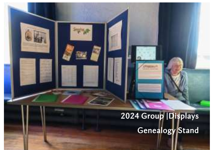
2024 Group | Displays Genealogy Stand