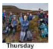
Thursday weekly longer walks

The Group Displays event is held annually in September at the Town Hall and this year's certainly attracted a great deal of interest both from our own members and the visiting public. It also resulted in ten new subscriptions. There will of course be an opportunity to participate in 2025 ~ so something to think about. The next few pages provide details of some of the Activity Groups together with reports from Group Leaders and images of the colourful stands at the Group Displays.