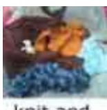
knit and natter