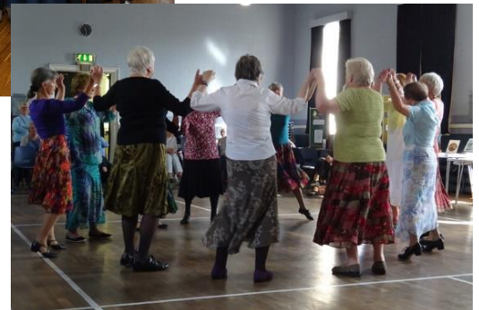
The Country Dance Group (ii)