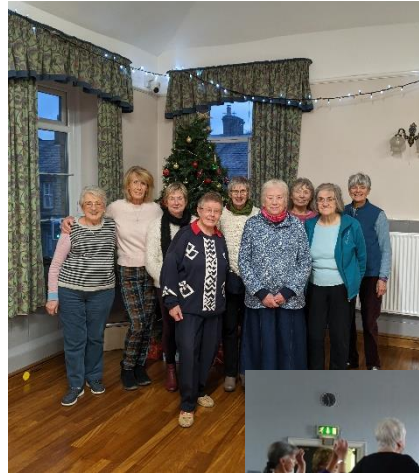
The Country Dance Group (i)