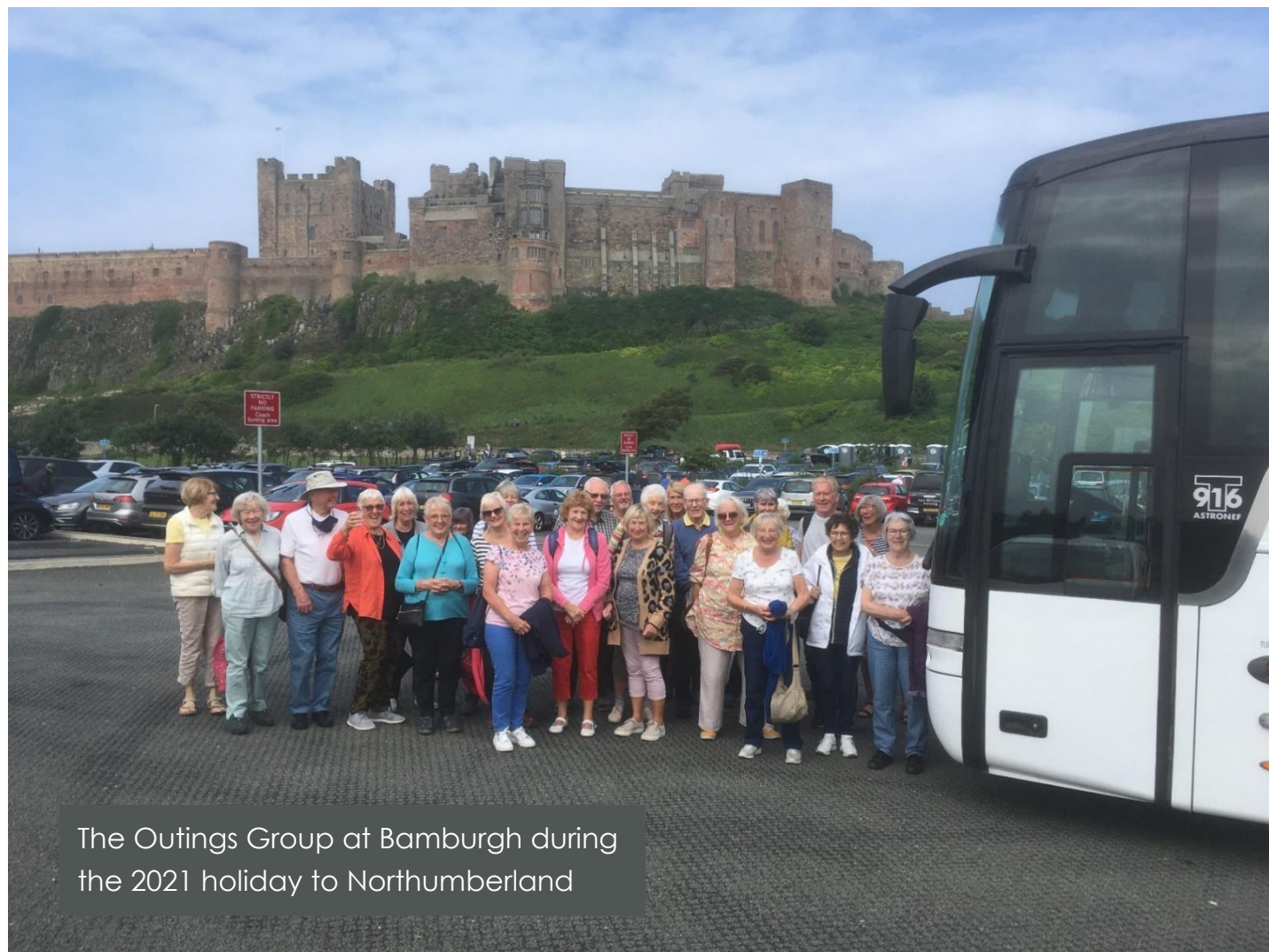
The Outings Group at Bamburgh during the 2021 holiday to Northumberland

Full information on Outings and Holidays can be found on the website and displayed on the Information Board at monthly meetings. Places are limited so it is wise to check availability.